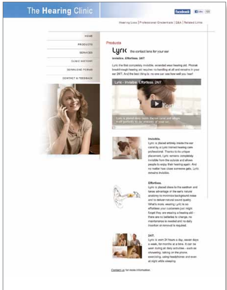
Add Lyric promotional information to your website