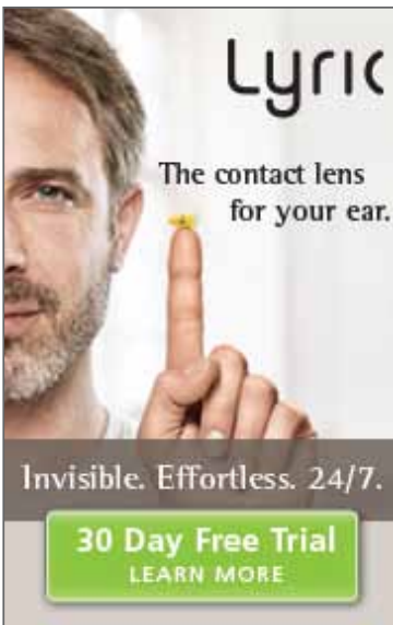
Home page Banner Ad