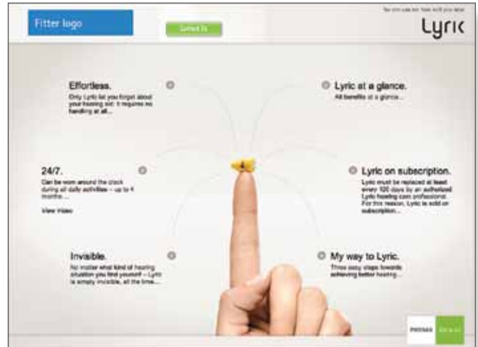
Lyric MicroSite Home Page

- Your website will show the 30 Day Free Trial Banner ad encouraging visitors to learn more about Lyric. When your visitor clicks on the ad, they will view all Lyric Microsite pages but under YOUR web address. This means that the patient never has to leave your website.